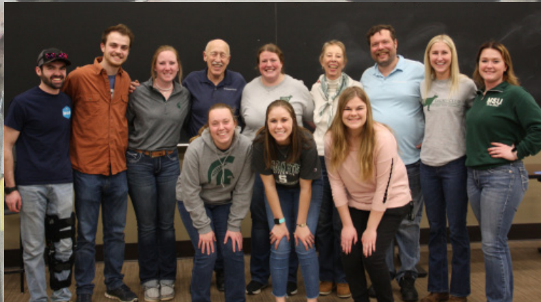
Dr. Pol spoke to students on how he became a vet and gave advice to current students